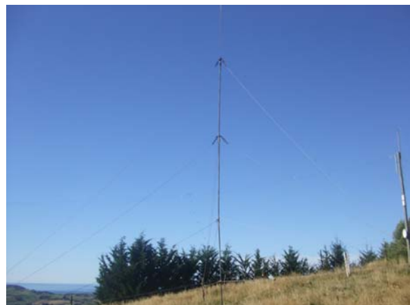
70 Year old ZC1 40m Vertical used in the contest